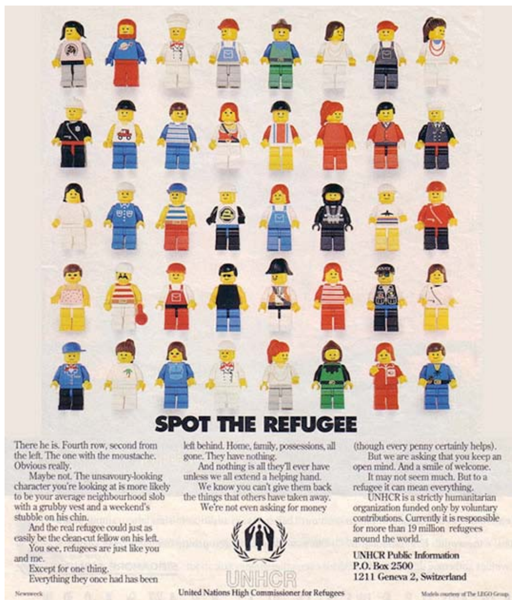
Figure 3: UNHCR Poster

The one with the moustache , you will nevertheless have been reeled in by the text, only to discover that you have been cheated, because